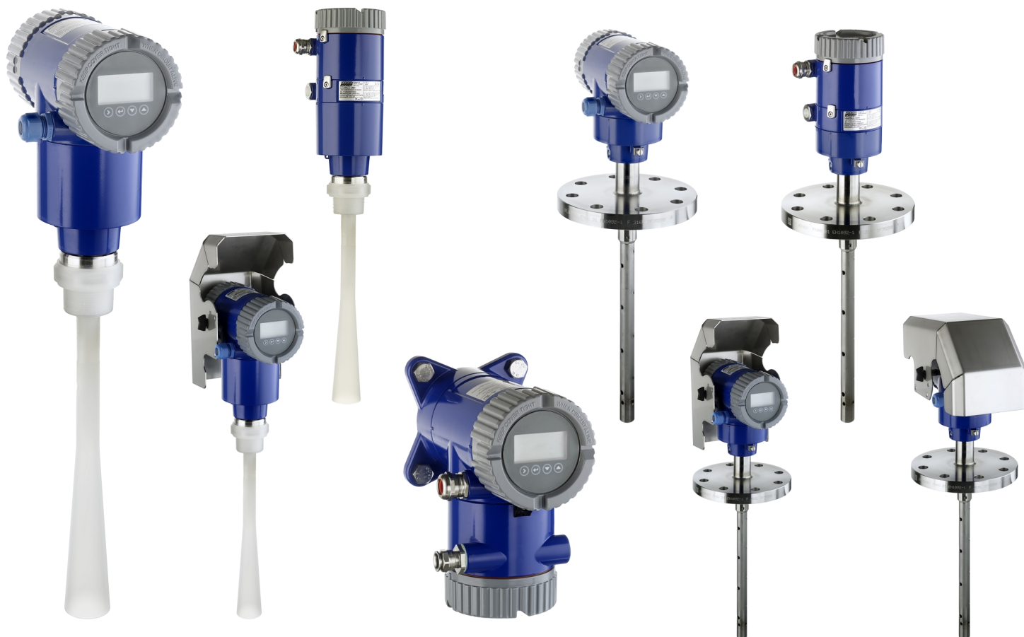
LevelWave Series including compact, remote and weather proof protection options

If you have any queries about which codes to use please email productsupport@foxboro-eckardt.de